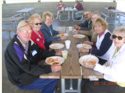
History buffs share stories at the 2010 picnic.