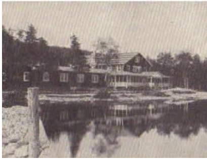
Alpine circa 1930?

Since as early as the turn of the last century there have been homes and businesses along the Egg Harbor shore. Some are still owned by the