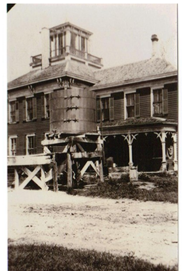
THE CUPOLA HOUSE WITH ITS OWN WATER TANK

“Perhaps there is a treasure trove of 20 th century Egg Harbor history hidden in the home of a descendent of an early visitor to Egg Harbor.”